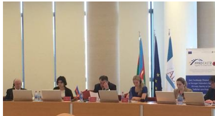
Table Top Exercise on EU Civil Protection Mechanism and Host Nation Support

On February 24-25 the Center of Excellence in EU Studies along with the Ministry of Emergency Situations of the Republic of Azerbaijan co-hosted a table-top exercise for representatives from